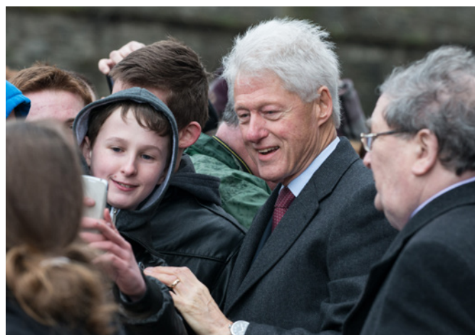
President Bill Clinton in Guildhall Square