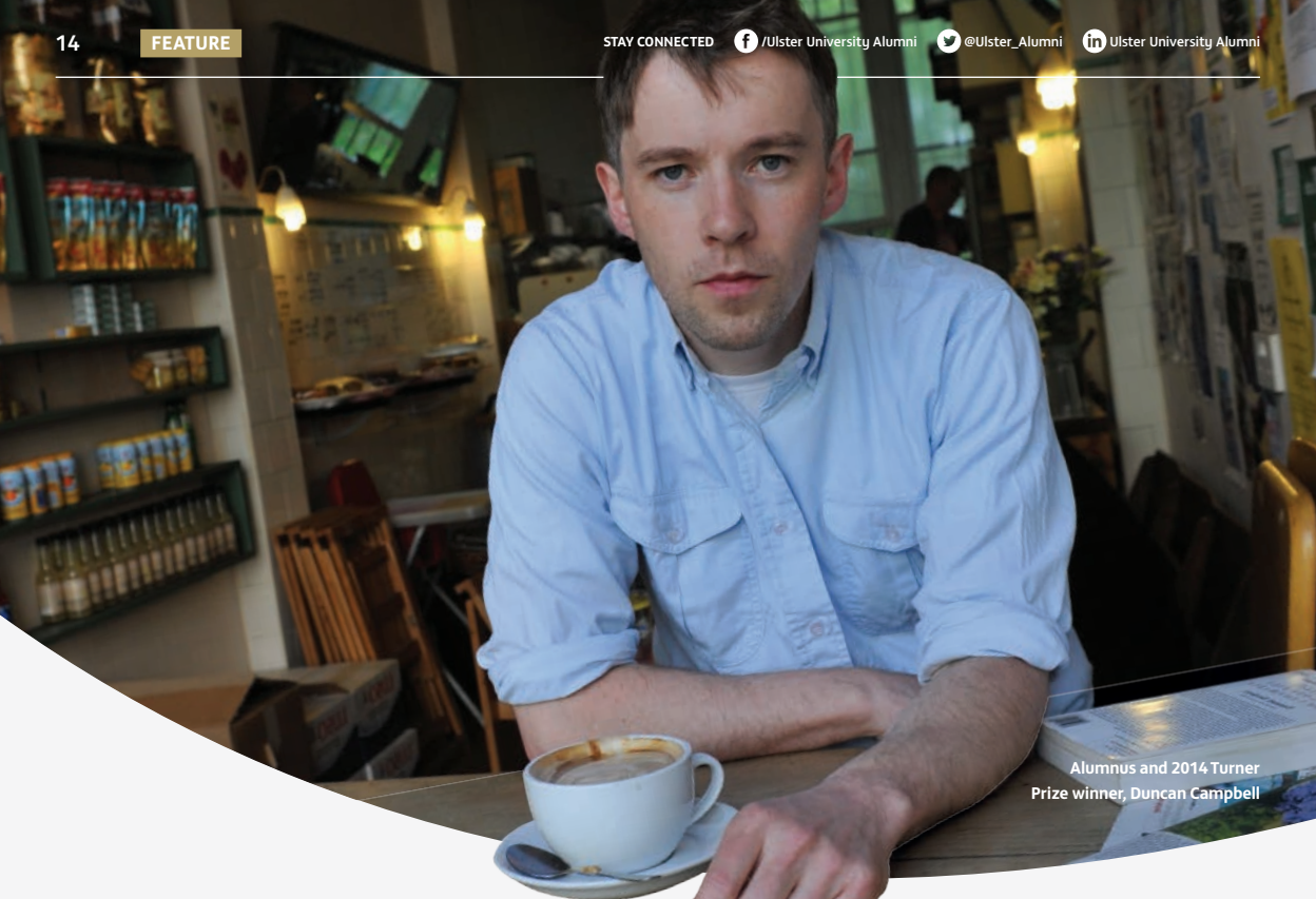
Alumnus and 2014 Turner Prize winner, Duncan Campbell