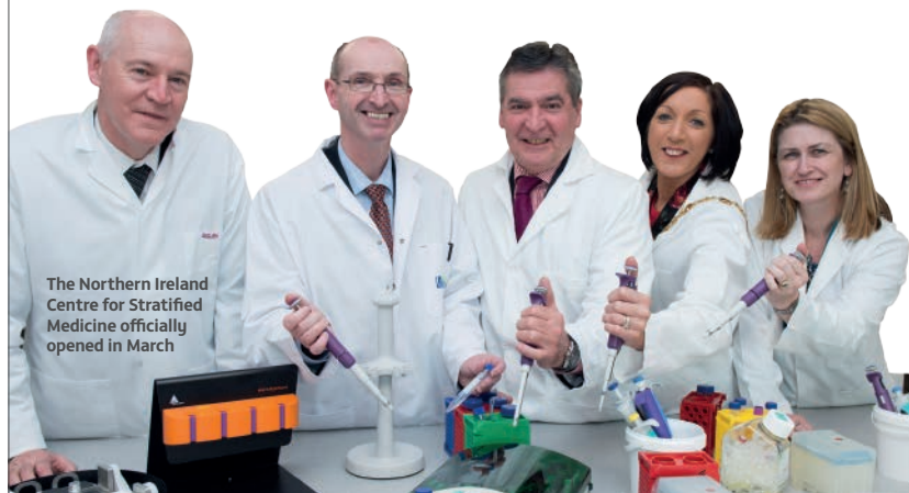
The Northern Ireland Centre for Stratified Medicine officially opened in March

The new Centre, based in the Clinical Translational Research and Innovations Centre (C-TRIC) at Altnagelvin Area Hospital in Derry~Londonderry, focuses on personalised medicine approaches to managing chronic diseases and is at the cutting edge of medical research.